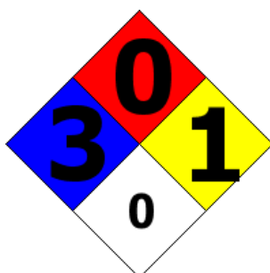
NFPA SCALE (0-4)